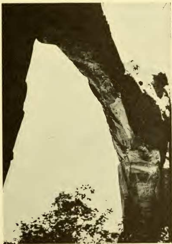
Figure 4. Natural Bridge, near the mouth of Calf Creek.

The grazing of sheep, horses and cattle in the Kaiparowits region has made changes in the plant cover and the native fauna. Thousands